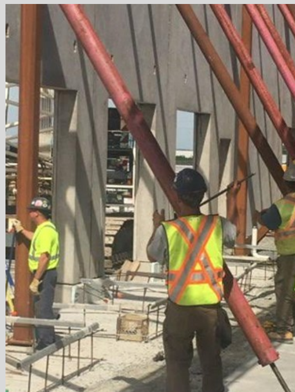
Above: Lindsay Construction, Leons Distribution center, Burnside, NS