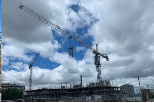
A crane above Arnoldin's Richmond Yard