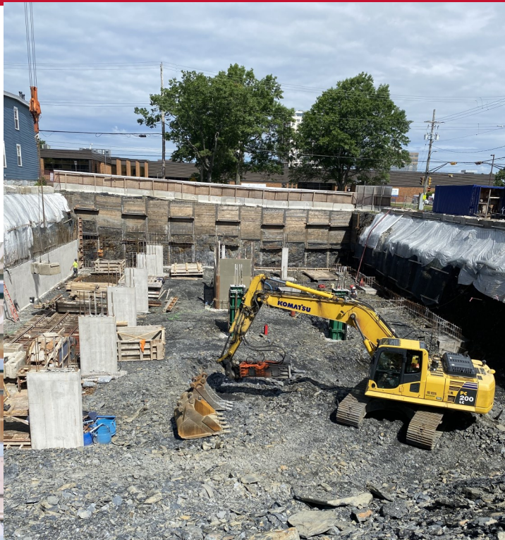
Omega construction working at Gladestone.