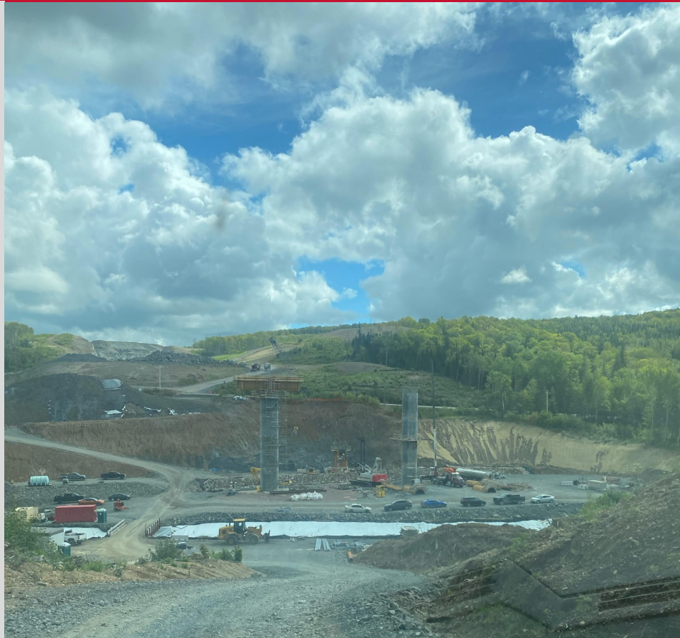
Able infrastructure Local 594 twinning of Hwy #104 construction of two piers.