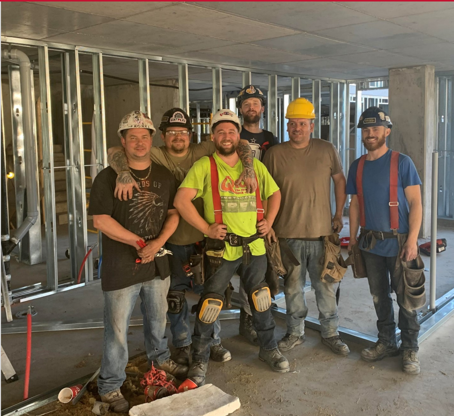
Photo of our members from Pinaud job site at 3411 Joseph Howe.